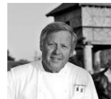
Chef Georges Blanc