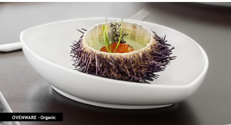
OVENWARE - Organic