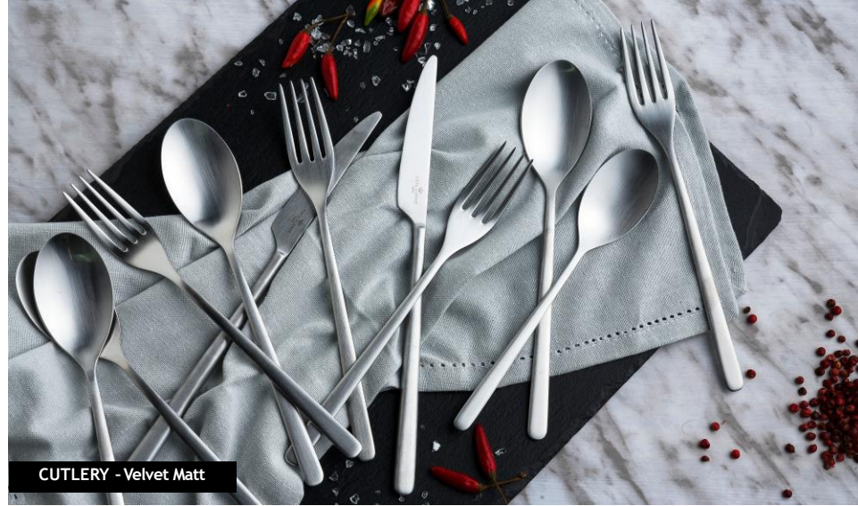
CUTLERY - Velvet Matt