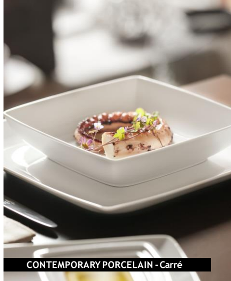
CONTEMPORARY PORCELAIN - Carré