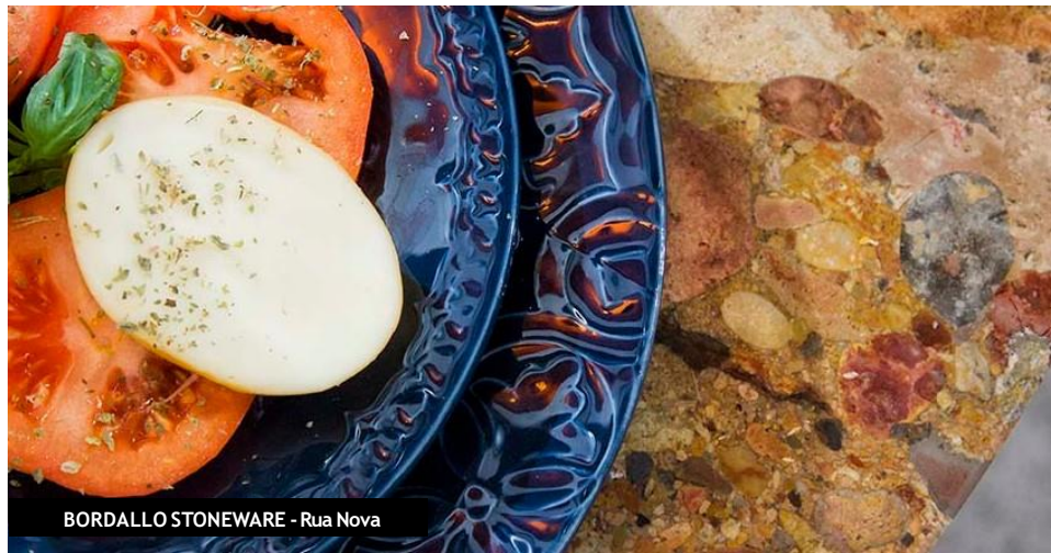
BORDALLO STONEWARE - Rua Nova