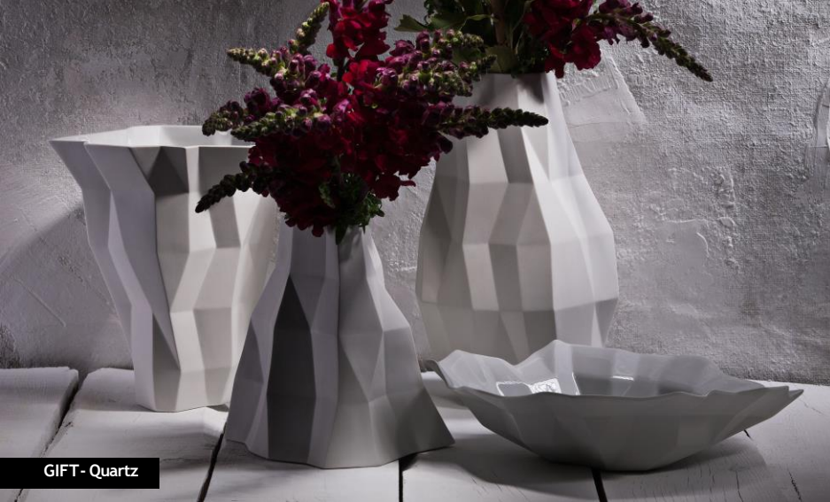
GIFT - Quartz