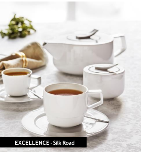
EXCELLENCE - Silk Road