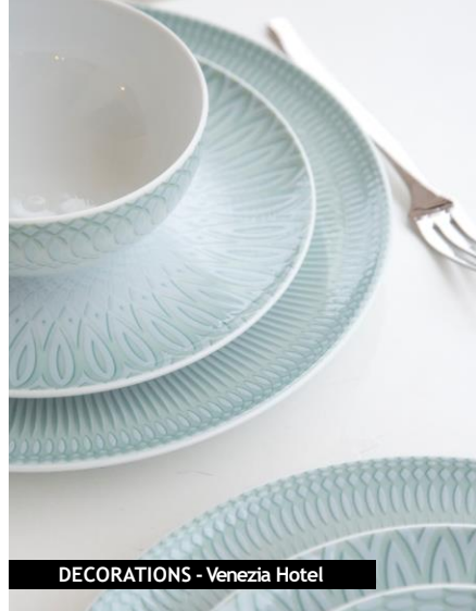
DECORATIONS - Venezia Hotel