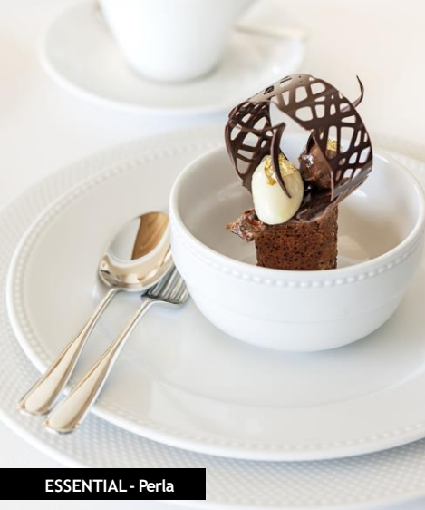
ESSENTIAL - Perla