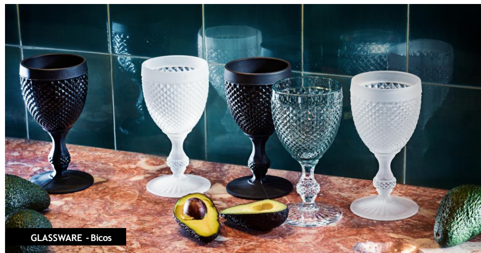
GLASSWARE - Bicos