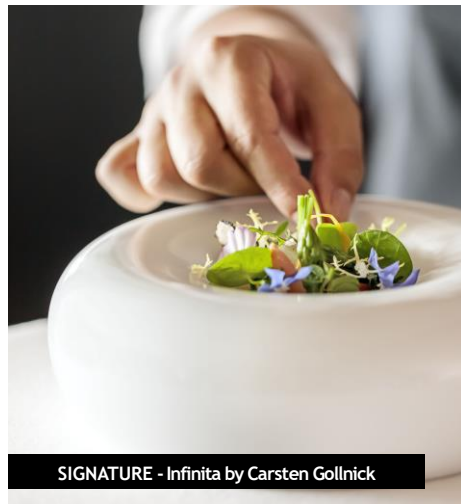
SIGNATURE - Infinita by Carsten Gollnick