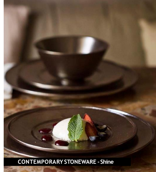
CONTEMPORARY STONEWARE - Shine