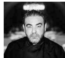
Chef Juan Amador